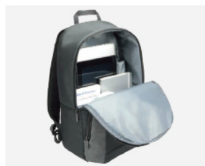
With reinforced laptop storage and tablet storage